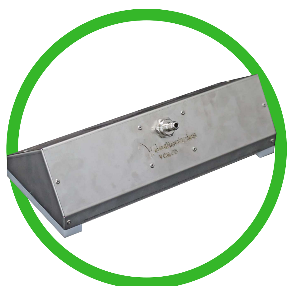
Versitech 35 Cover Head (VCH 35)