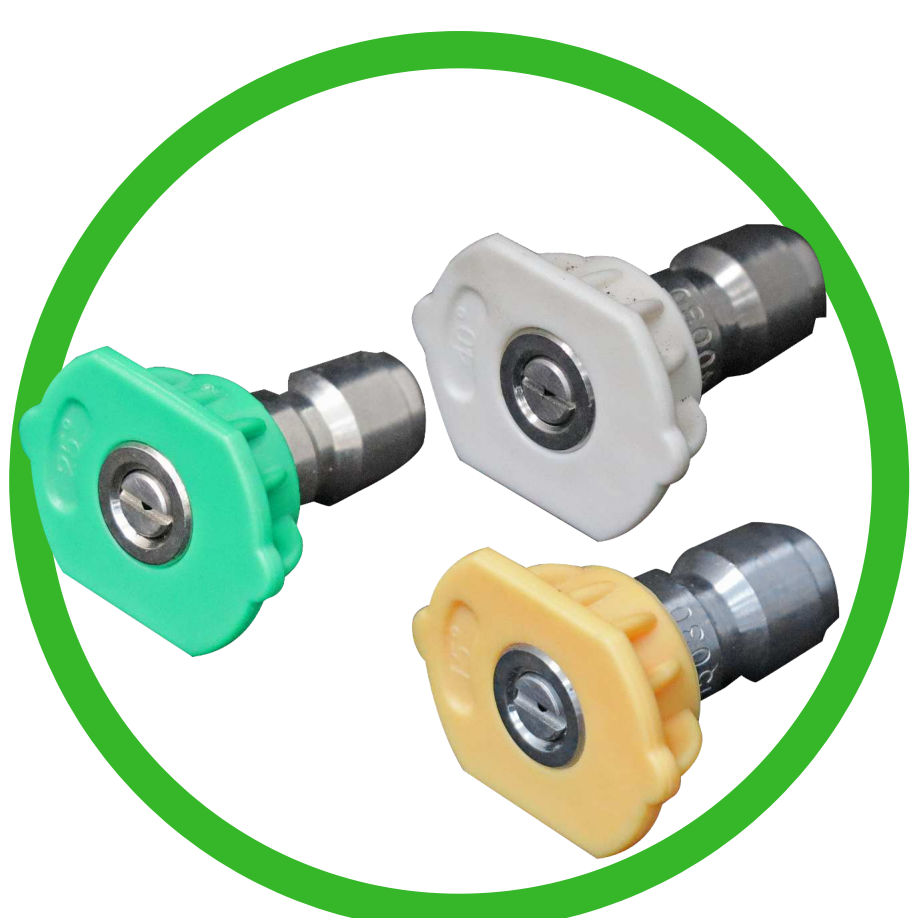
Pressure Cleaning Nozzles