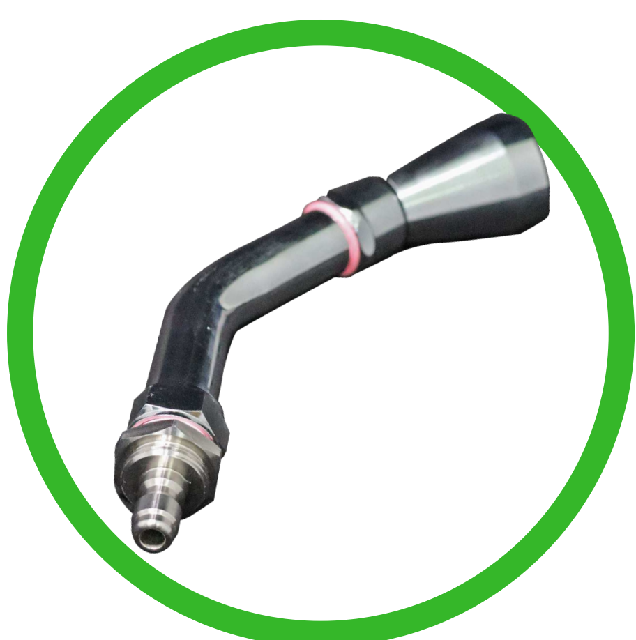
Versitech Open Head (VOH)