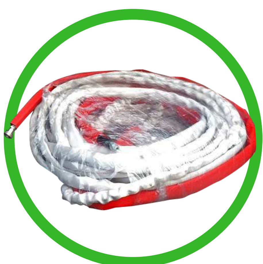
30m Insulated hose (Extendable)