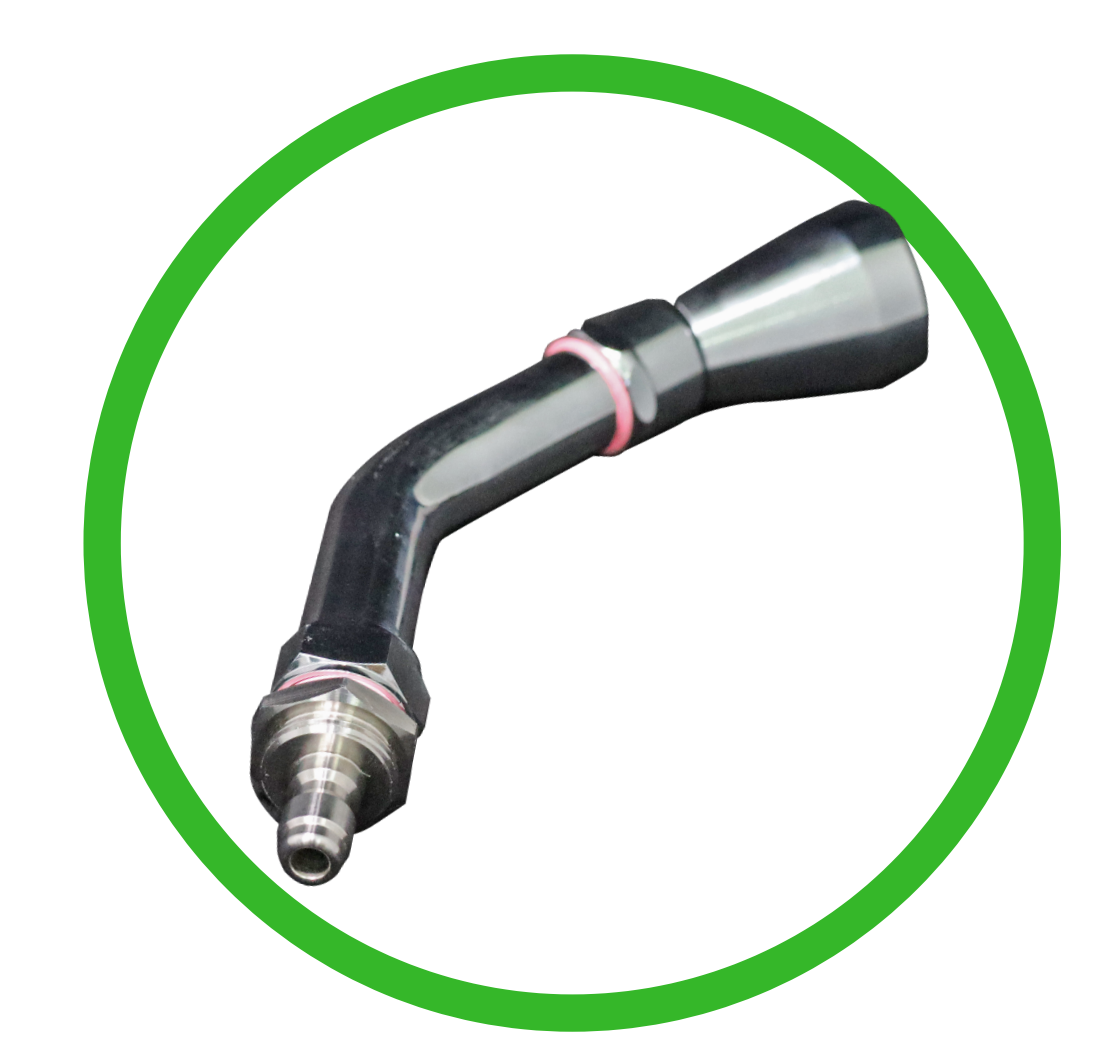
Versitech Open Head (VOH)