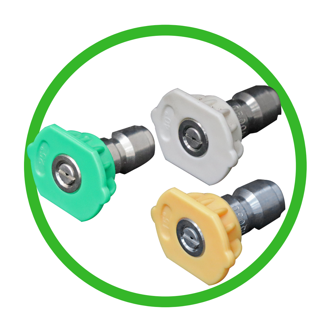
Pressure Cleaning Nozzles