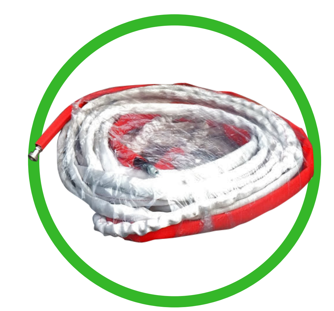
Up to 90m Insulated Hose with Clip-on Cover