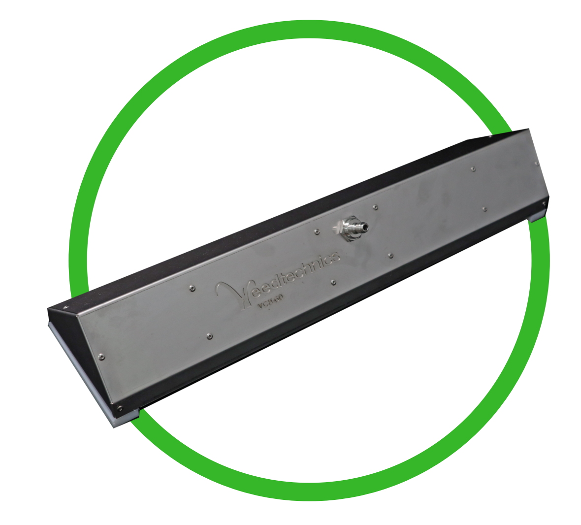
Versitech 60 Cover Head (VCH 60)